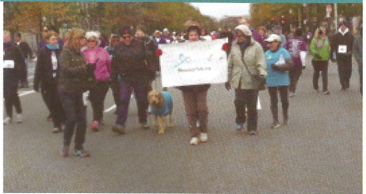
Rhonda's Club supporters at the Race to End Women's Cancers.

We pledged to raise $25,000 over four years for Stand Up To Cancer's newly formed Ovarian Cancer